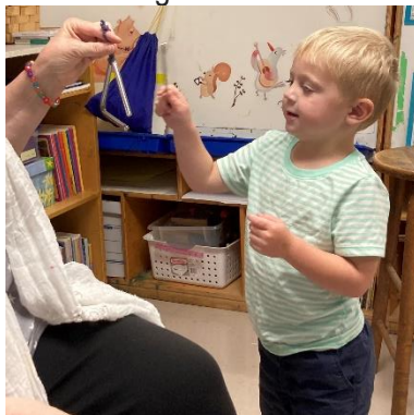
The Starfish are learning about the triangle.